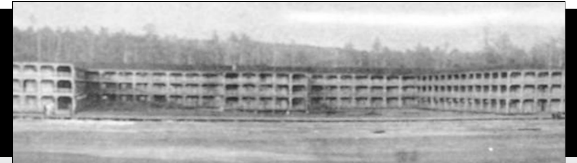
The famous 270 room Moclips Beach Hotel, circa 1908. The first hotel burned after 5 months of operation in 1905. It was rebuilt in 1907. Subsequent storms and tidal surges in 1911, 1913 and 1914 totally destroyed the hotel again. If it remained today, the Moclips Beach Hotel would by far the largest hotel on the Washington Coast.