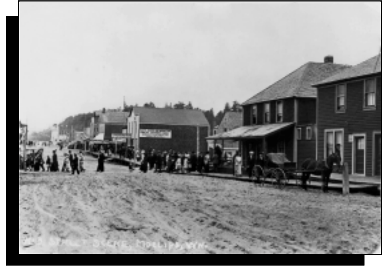
Downtown Moclips circa 1910. Looking north on Pacific Avenue.

Open: Friday - Monday thru September - 11am till 4pm Weekends - October thru May 1 - 11am - 4pm