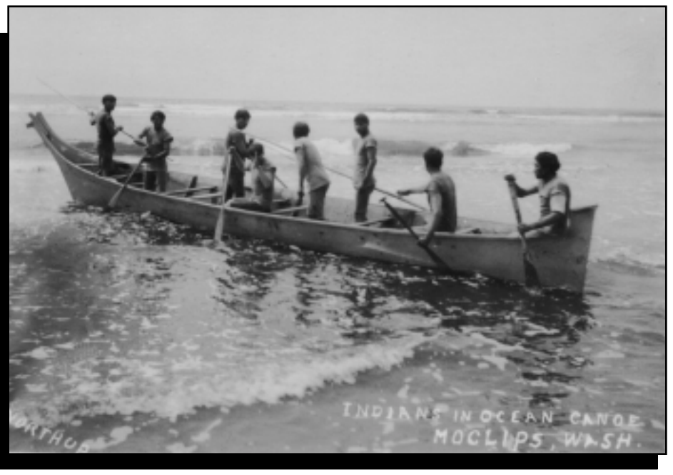
Quinault tribal members in an ocean going cedar canoe at Moclips, circa 1910.